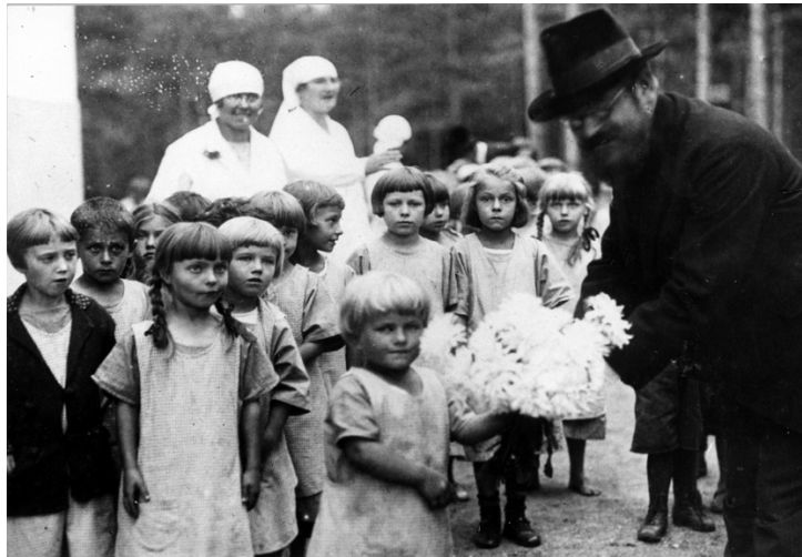
1927, Albert Thomas receiving flowers from workers' children in Ogre, Latvia. "A class which takes care of its children is already a class conscious of its destiny," he said.