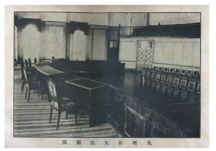
Grand Chamber of the Daliyuan

an immediate challenge by a long-standing social custom. In this way, the project contends that the practice of law produced a reflexive knowledge of law during the transitional years that brought together social and legal norms from pluralistic sources, while the legal basis for rendering a judgment in practice was shifting along the triangle of the old law, the translated codification and social custom.