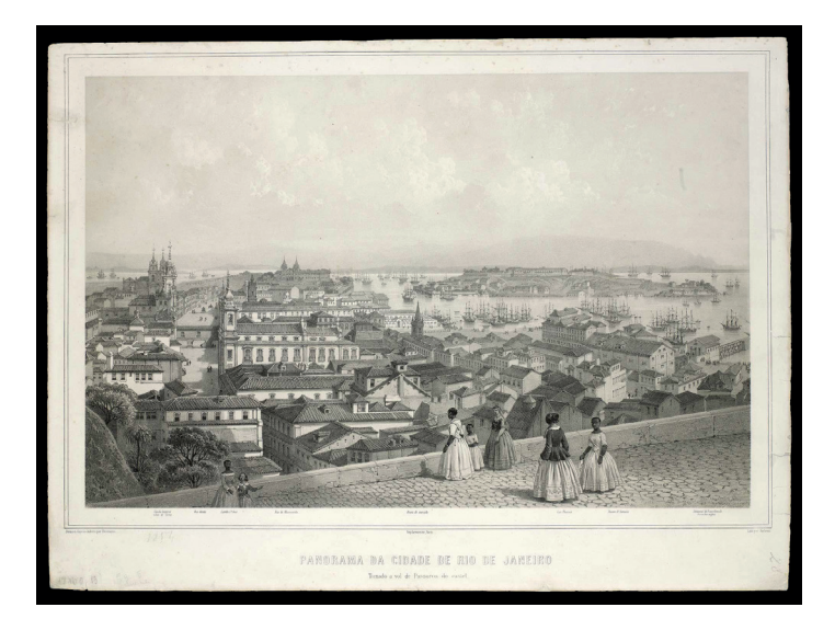
Louis Aubrun, Panorama da cidade de Rio de Janeiro, 1854

Preliminary results show that, in petitions and decisions, the Council of Trent adopted multiplex and distinctive functions, including, first, as a norm both rejected and protected by the state that was used as a model for civil norms; second, as a norm remodeled by the Holy See to address new phenomena; third, as a weapon of resistance against the episcopate; and fourth, as a norm informing joint strategies between the three levels of governance. Overall, this project challenges the explanatory power of 19th-century dichotomies such as the supposed opposition between the 'regalist, liberal state' and the 'ultramontane, Tridentine clergy'. Instead, it reveals the ecclesiastical administration in the complexity of its actual practice.