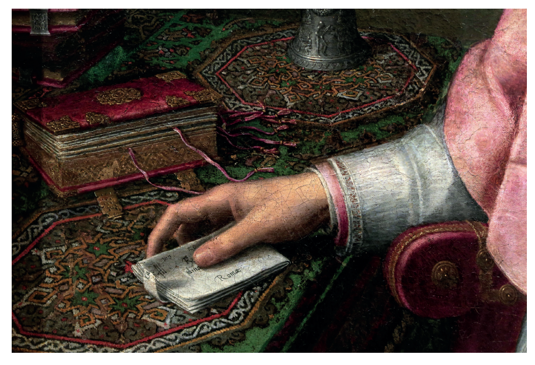
Anonymous, Cardinal Innocenzo Cibo (detail)