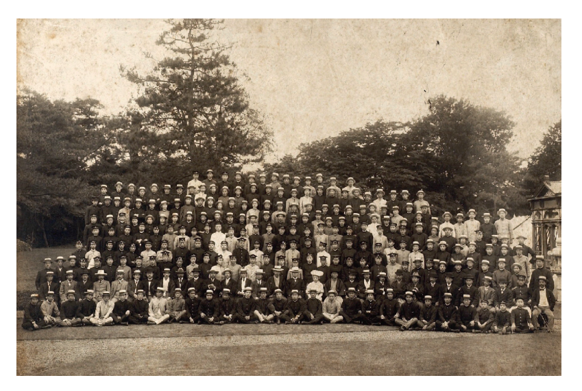
Graduation group photo of the Waseda University preparatory course for Chinese students, 1907

show how networks formed already among the Chinese student diaspora contributed to form a professional body of lawyers in China's large cities. The development of modern legal professionalism, in turn, was a crucial factor that determined the implementation of the new legal codes enacted during the Republic.